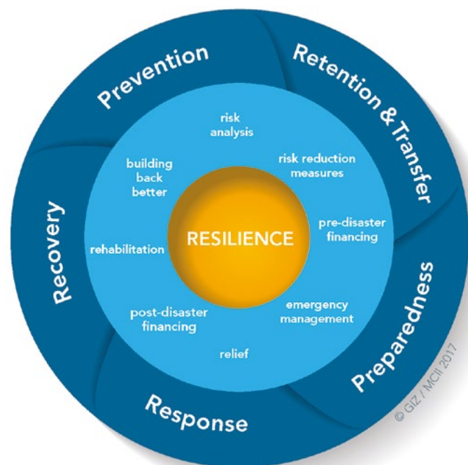
Figure 1: Integrated climate risk management approach

Comprehensive climate risk management approaches are urgently needed to reduce, transfer and manage risks posed by climate change. As such, agricultural insurance is not a stand-alone solution and should build on existing measures and frameworks. Thus, the integrated climate risk management approach is a conceptual framework that advances the framework (BMZ, 2015) of the German Federal Ministry for Economic Cooperation and Development (BMZ). This ICRM approach offers a risk-oriented and comprehensive conceptual framework which incorporates climate change adaptation measures into disaster risk management policies in order to achieve national development goals.